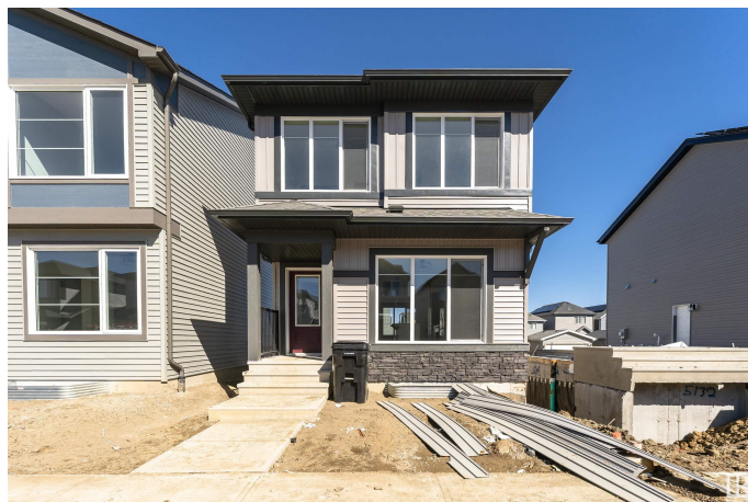
5134 Kinney Wy, Edmonton, AB

Main Floor Exterior Area 680.07 sq ft Interior Area 619.92 sq ft