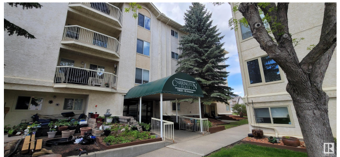
Carrington Place Building C

SUITE TYPE 2 D + DEN 1388 sq ft (1329 sq ft) FLOOR AREAS SHOWN MAY VARY FROM ACTUAL CONSTRUCTED UNITS.